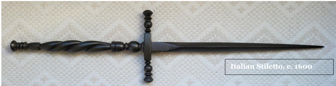
Italian Stiletto, c. 1600