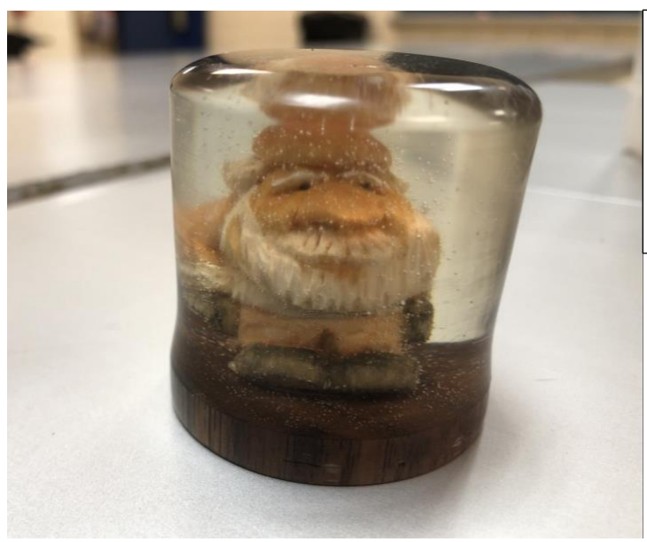
Bob Holtje has been experimenting with encasing tiny carvings in resin and making unique bottle stoppers