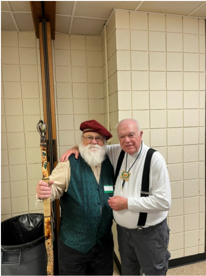
Old friends with the holiday spirit!