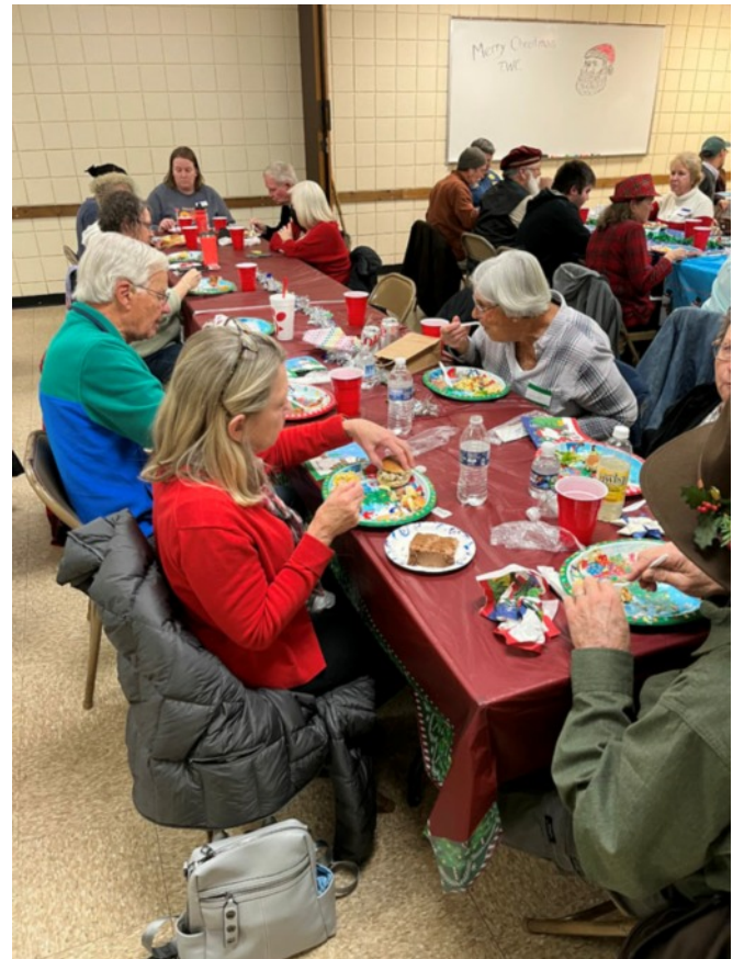
A festive gathering for all